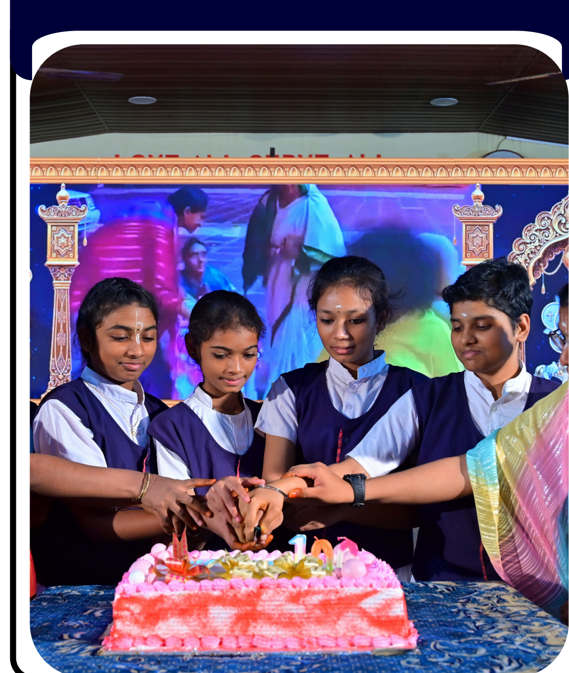
Baba's 100th birthday celebrations

Devotional and cultural programs observed