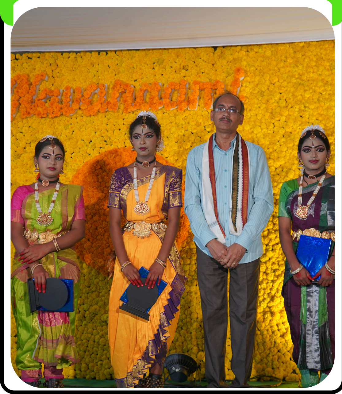
Ugadi cultural performance

Dance performance at Navanami Apartments (22 Mar 2026)