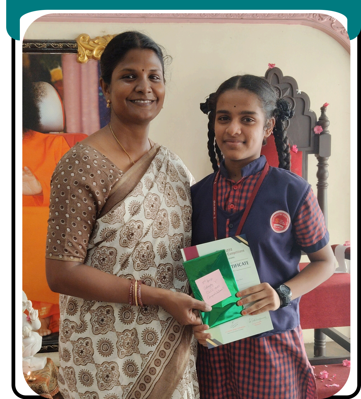
Bhagavad Gita chanting

Prayers and cultural programs in devotion