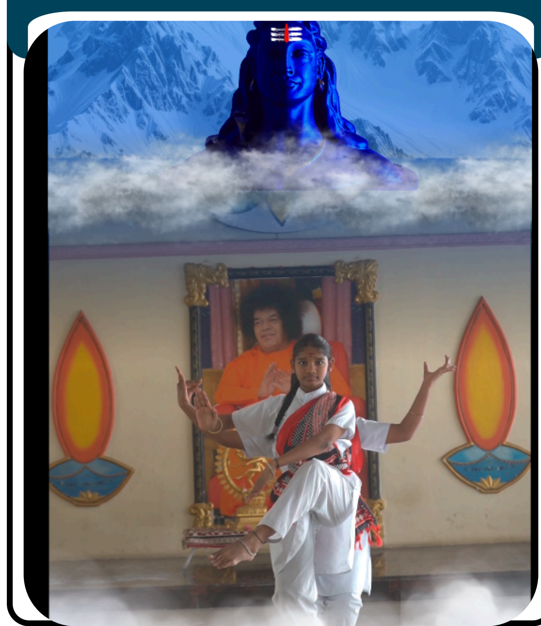
Mahasamadhi Day & Guru Purnima

Dance performance at Navanami Apartments (22 Mar 2026)