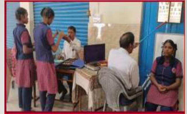
Medical & Eye camps-SSSVM NB Seva Trust