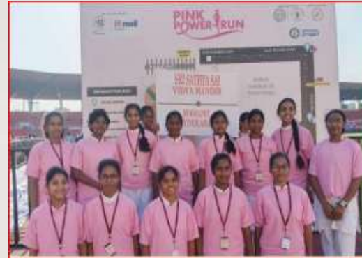
Pink Power Run