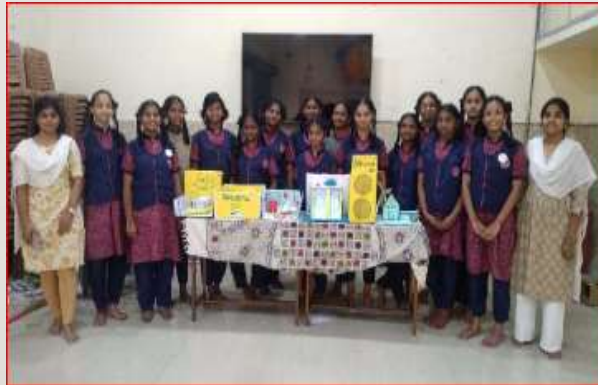
Robotics Soham Academy