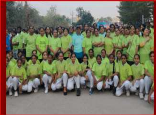
Global Grace Cancer Run