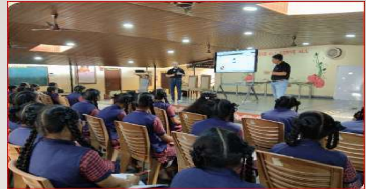
Microsoft Advanced Excel & AI Skills- Global Data