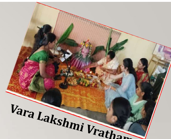
Vara Lakshmi Vratham