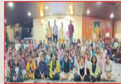
Nutrition - Mankind Pharma