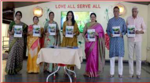
SEEDS LAUNCH Programm