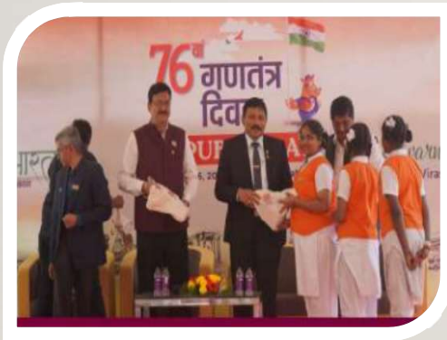
Indian Oil Corporation