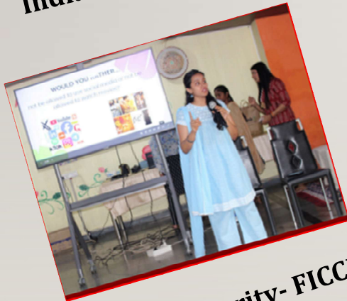
Cyber Security- FICCI Team