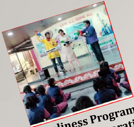
Cleanliness Program - Indian Oil Corporation