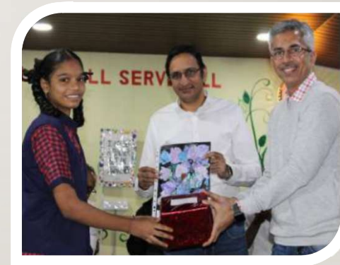
Worley Services India Pvt Ltd