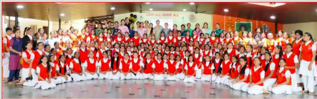
Teachers Day Celebrations