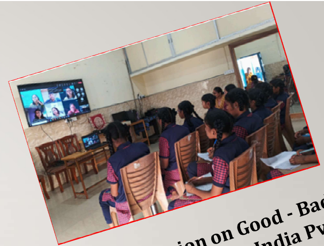
Virtual Session on Good - Bad Touch Worley Services India Pvt Ltd