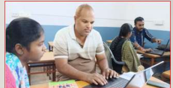
Career Guidance-Class 10 NIRMAAN Team