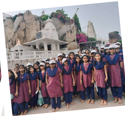
Ramanuja Charya Statue