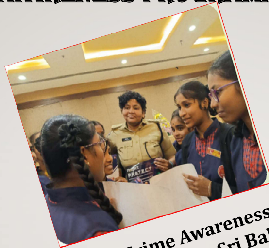
Cyber Crime Awareness - Police Commissioner Sri Bala Garu