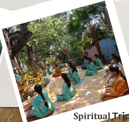
Spiritual Trip to Puttaparthi