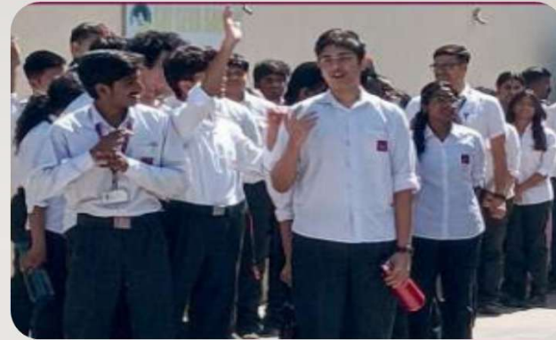
Silver Oaks International School