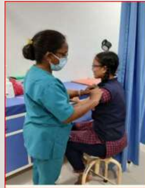
Cervical Cancer Vaccination- Ramdev Hospital